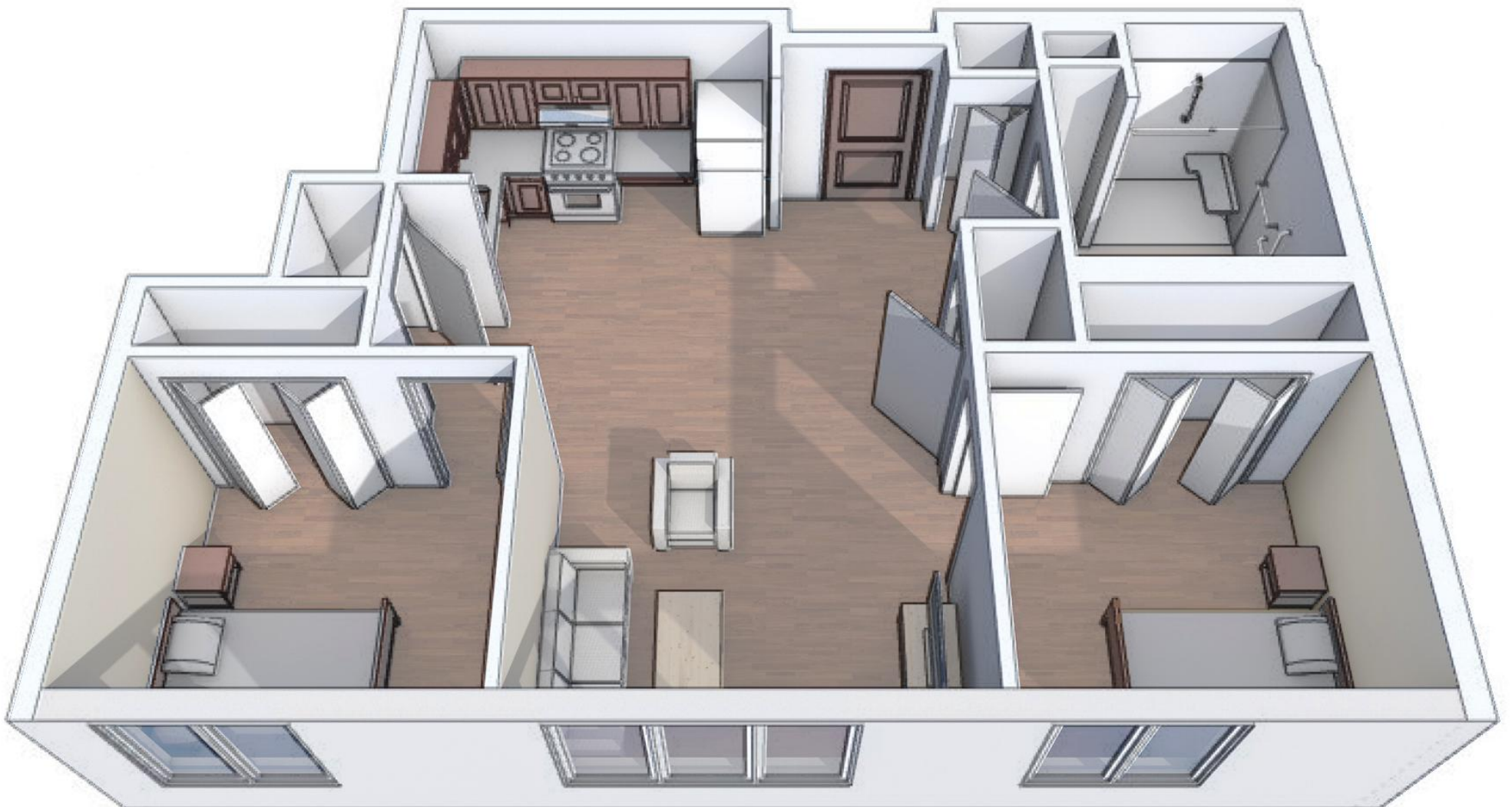
B Unit 183 - Rendering