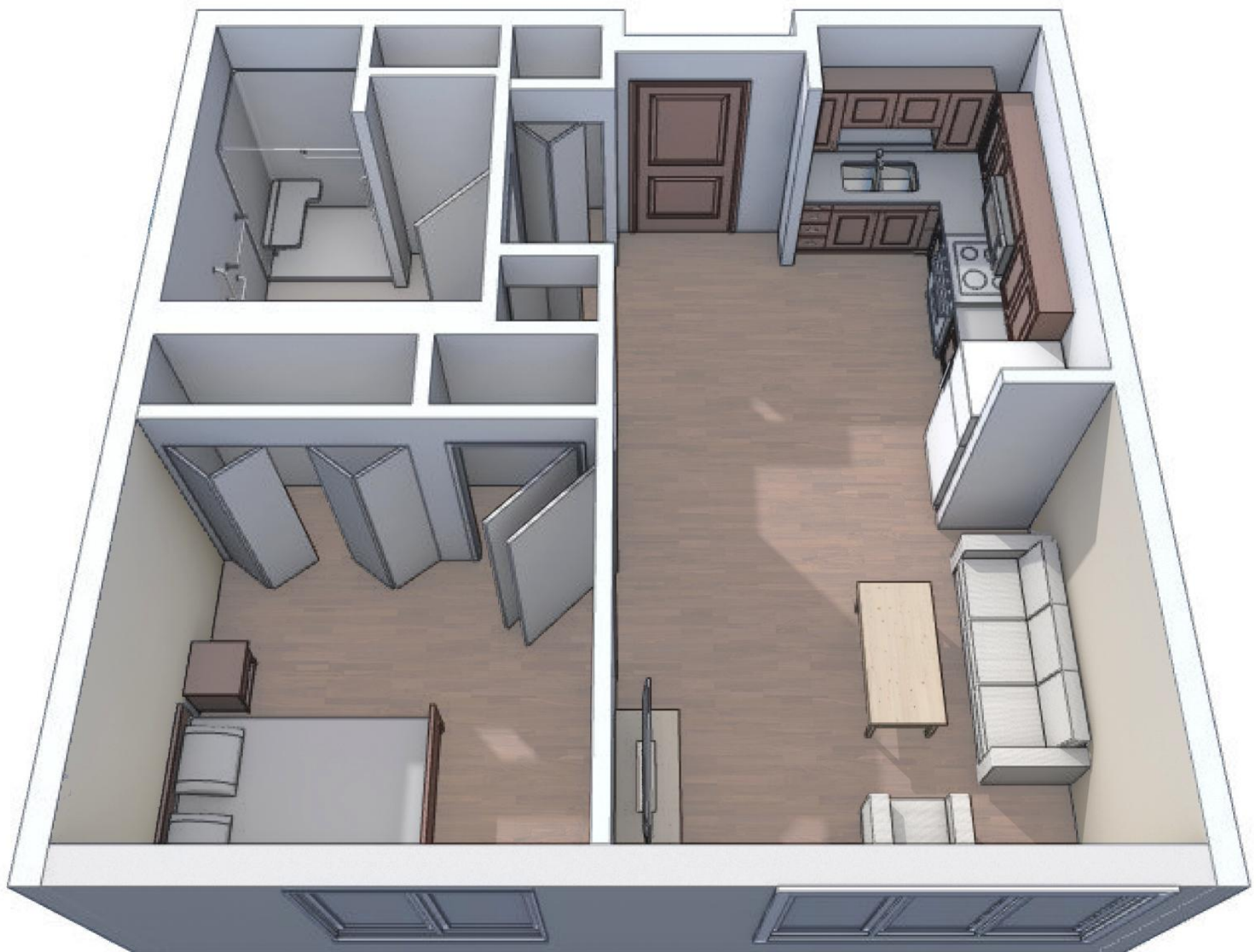
B Addition 1-BR - Rendering